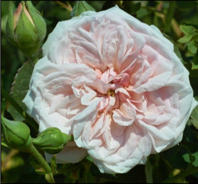
Souvenir de la Malmaison