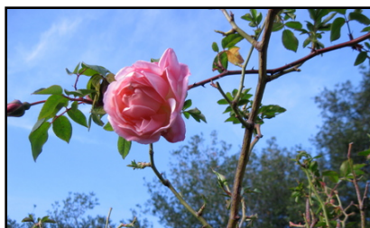
Souvenir de Mme Leonie Viennot