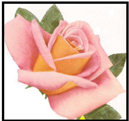
Helen Traubel Montgomery Ward catalog 1954