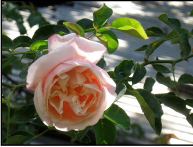
Gloire de Dijon