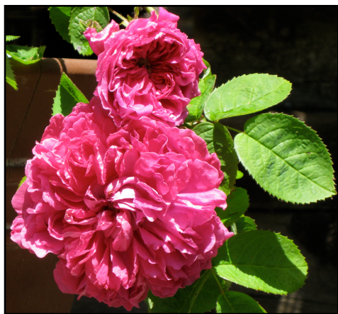
Rose du Roi

Josephine’s desire for roses induced many nurserymen of the time to produce more roses. It was the beginning of rose mania, which lasted almost 200 years, and Malmaison was its hub.