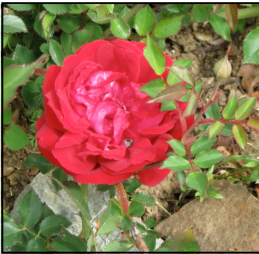
Agrippina aka Cramoisi Superieure