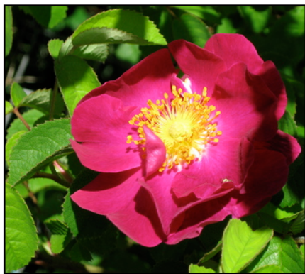
Violacea aka La Belle Sultane