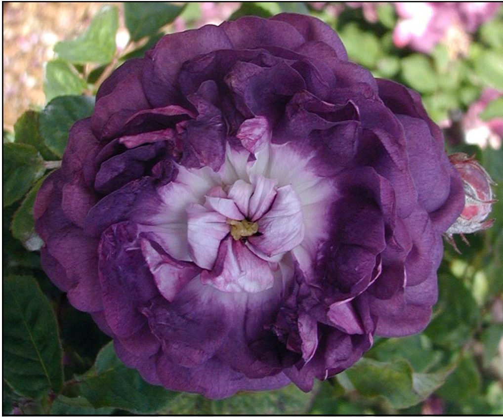
'Cardinal de Richelieu'

strongly scented Centifolia (some claim it is a gallica) grows about four feet tall, a height more suggestive of gallica than Centifolia, which generally attain heights of five to seven feet.