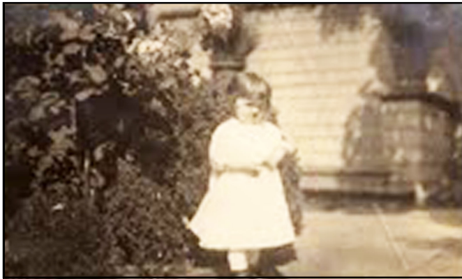
The Garden in 1911

I was stunned. I ran to my father-in-law who chuckled and told me that all of those things were roses, planted by his parents or grandparents. He told me the names of the ones he knew. He said that the one up the plum tree was called " America La France ", and that the buff colored one was called " Marechal