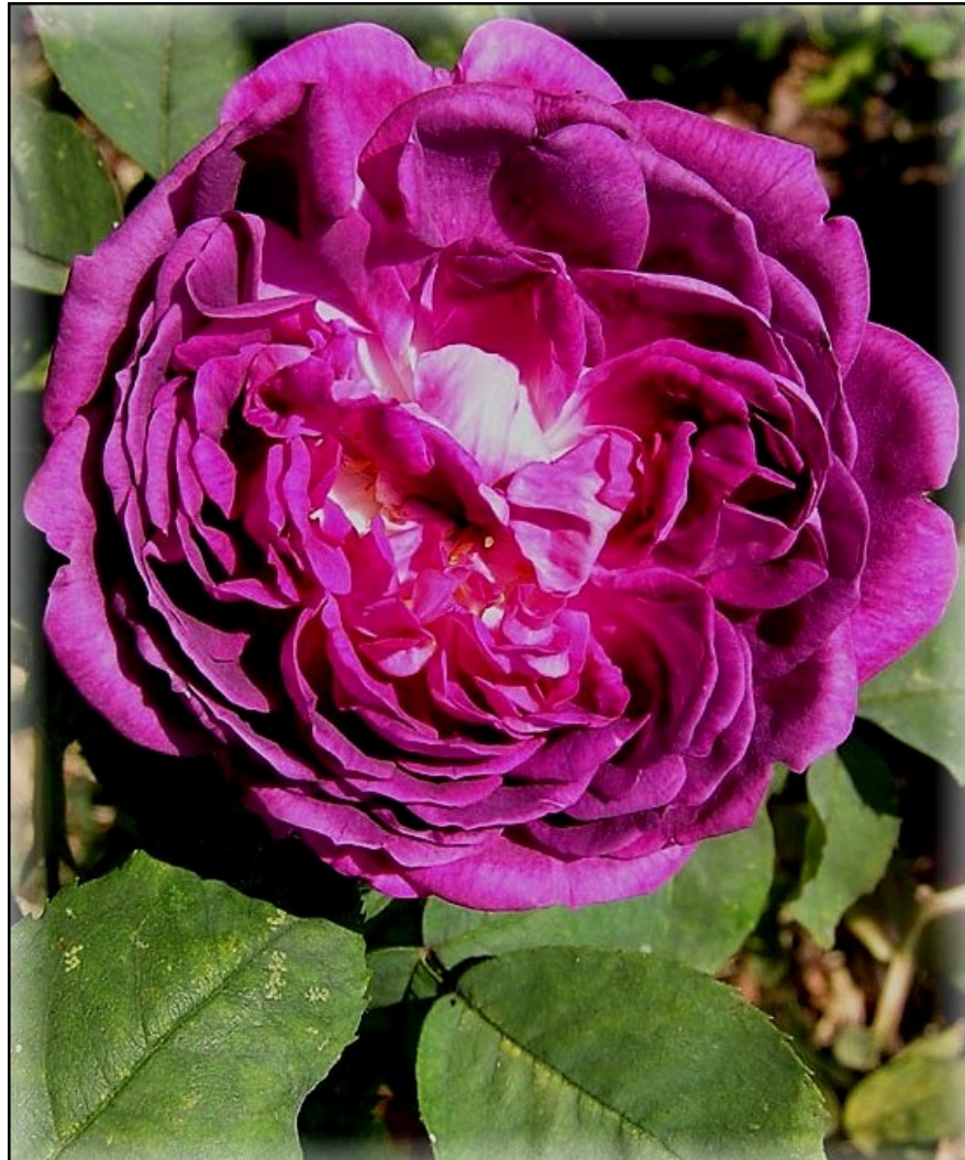
'Reine des Violettes'

floriferous beauty. This mauve-lilac hybrid perpetual has been described by Graham Thomas as “ dark, soft grape purple, later fading to softest parma violet. ” Perhaps England’s (imported?) grapes are darker than those in California, but I have never seen my rose as dark purple. Soft sunset purple, parma violet, yes. Its flowers are rather like those of a double gallica. It bears no prickles and no grudges. Even in this essay she reads like a peaceful interlude.