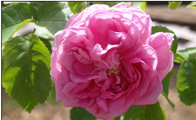
“Linsley Plot Quartered Pink” A Foundling of The Sierra Foothills