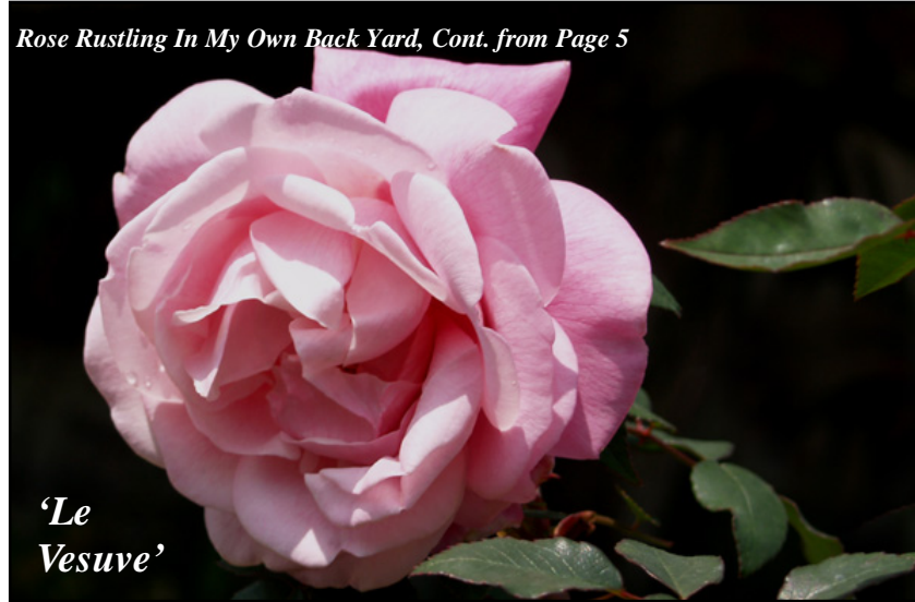
Rose Rustling In My Own Back Yard, Cont. from Page 5

Francisco every day, and had no time to worry about plants.