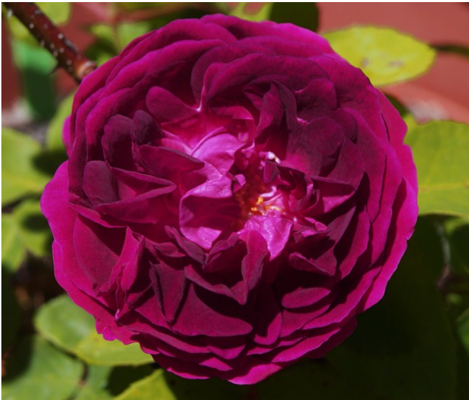
The “Pulich Children” Rose