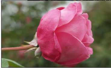
'Mrs. B.R. Cant'