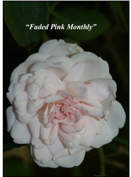
"Faded Pink Monthly"