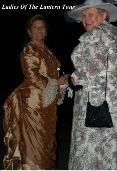
Ladies Of The Lantern Tour