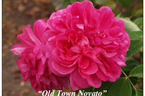
"Old Town Novato"