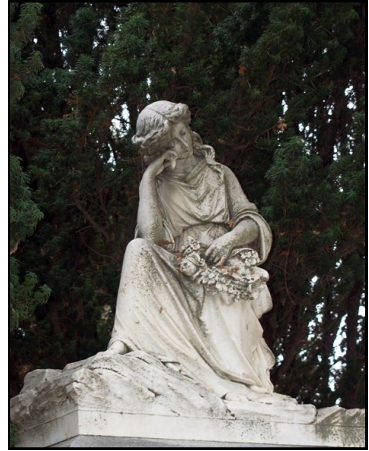
'Kaiserin August Victoria'