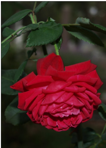
"Cheshire Red," Found Red China

Friday evening was "meet and greet" time — with wine and hors d'oeuvres in the cemetery. What fun to meet for the first time people we've been "talking" with on line for years! A Lantern-Light Tour of the old Cemetery followed, featuring more "introductions" this time to some of the more interesting, famous (and infamous)