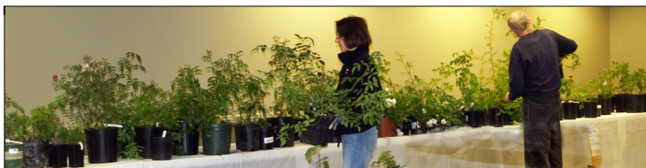
Preparing For The Great Sale Of Rare And Unusual Roses